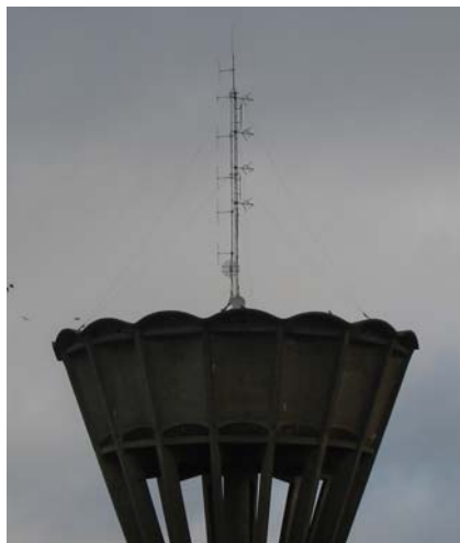
Transmission site for LifeFM

We need church representatives for the various churches, who would distribute the newsletters and other information on Life FM. Please let us know if you would be interested.